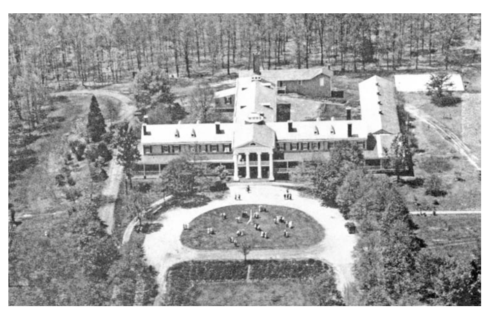
Chevy Chase School in 1928

The school colors in those days were orange and black; later they became gold and black. No sororities were tolerated. As for dress, the school suggested two Peter Thompson sailor suits for school hours, a black gym suit with "full bloomers," a tailor made suit for street and church wear with two "waists" for the suit, and two "reception" gowns. Prohibited were dresses with a "low neck, only Dutch necks allowed."