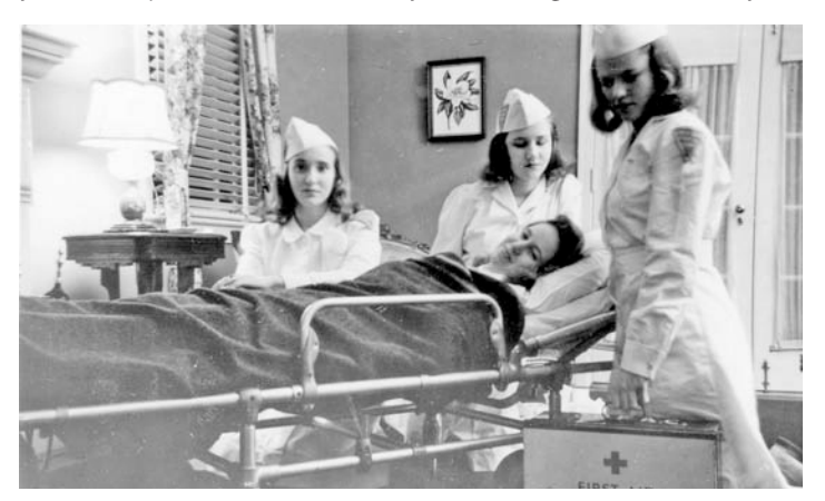
Student Red Cross exercises

For the young ladies at the Seminary, as it was then commonly called, days were busy: rising bell at 6:45 a.m., prayers at 7:30 a.m., breakfast at 7:45 a.m., study and recitation from 8:30 a.m. until 1 p.m., lunch, then recreation, practice, gymnastics, athletics and Domestic Science in the afternoon, dinner at 6 p.m., study from 7:30 to 9:30 p.m. and lights out at 10 p.m.