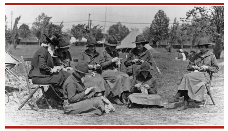
NSS students making Red Cross sponges

The school's main objective was "to train women to be of real national service along the lines to which they can best serve and ... give impetus to the movement for national service among young women". President Woodrow Wilson presided over the opening ceremonies with the rallying cry, "The nation is awake!"