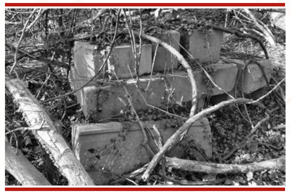
Mysterious cut stones piled along the Capital Crescent Trail

Just 45 feet short of the fence at the Columbia Country Club, approximately 40 cut stones have been abandoned. Coated with moss and strangled in vines, they have clearly been there for some time. The majority are heaped in a high and weighty pile, others randomly scattered nearby. Some bear the distinctive marks of a mason-carver. One is a triangle. Most are blocks of differing sizes. The