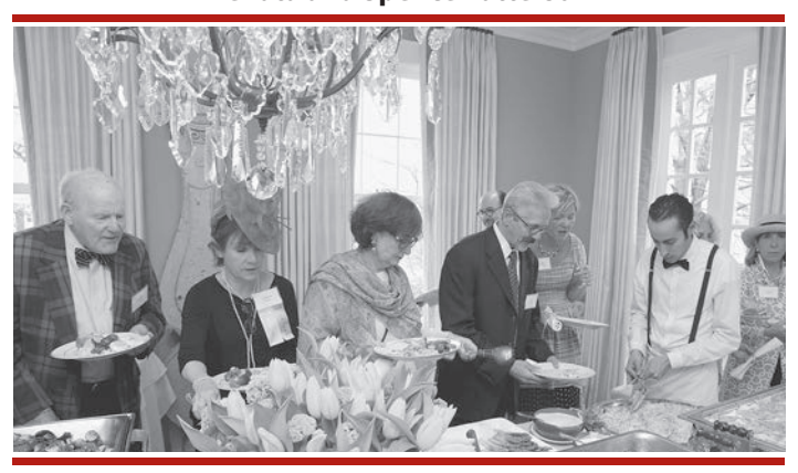
Guests enjoy the sumptuous buffet