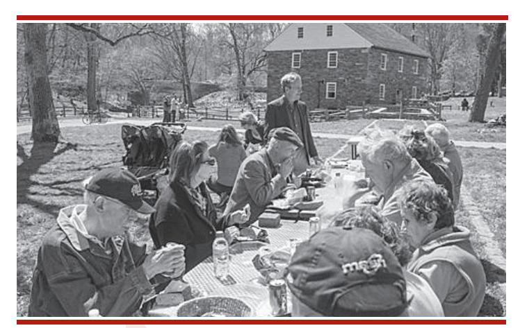
Picnic lunch on the banks of Rock Creek

Following the tour, attendees enjoyed a picnic lunch along the banks of Rock Creek, reveling in the warmth of the spring sunshine and the daffodils and wildflowers surrounding the mill.