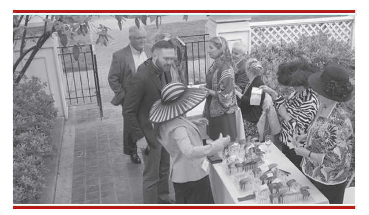
Society members and friends arrive in fine form, with hats!