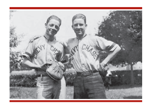
Chevy Chase baseball players