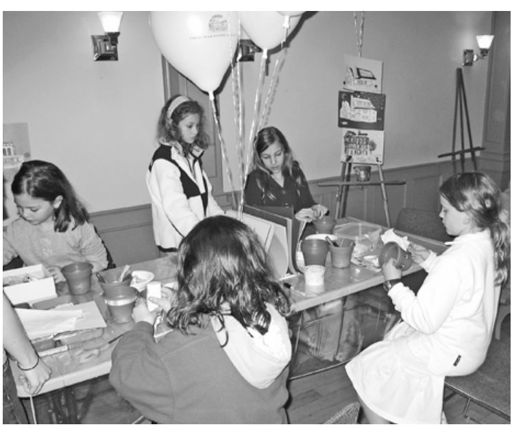
Young explorers "discover" how to decorate their flower pots