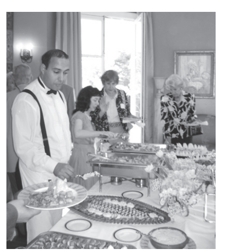
The groaning board