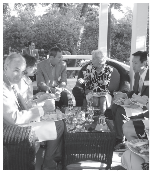
On a lovely evening, dining al fresco