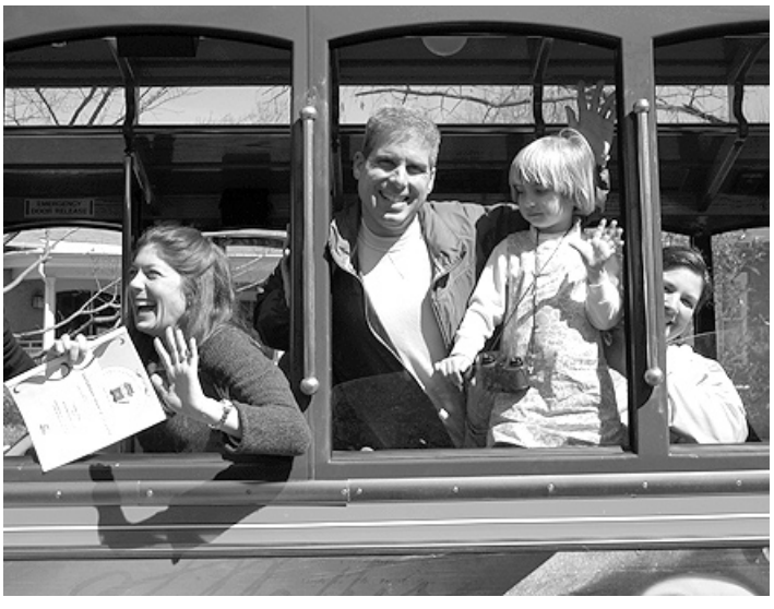
Family fun—a jolly hour in the trolley touring the Village