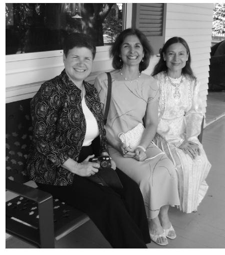
Three former students of The Chevy Chase Country Day School