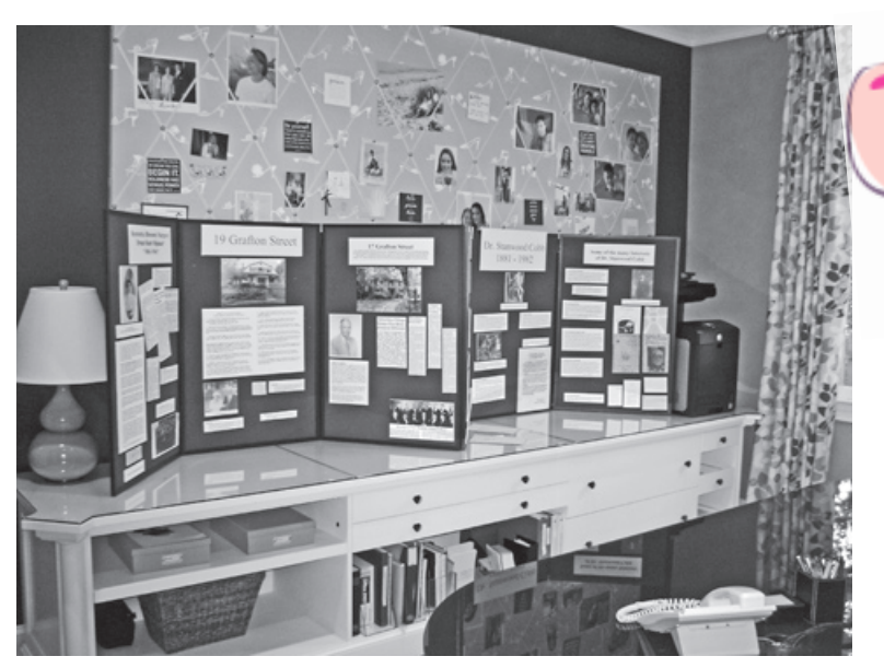
The history of the house and former school at 19 Grafton Street.