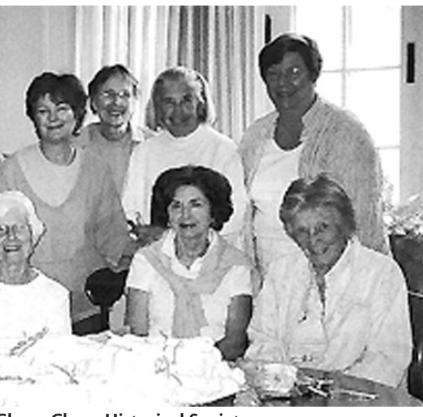
Chevy Chase Historical Society