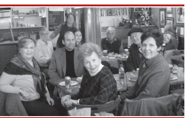
History lovers enjoy lunch at the Potter's House in Adams Morgan following the walking tour of Meridian Hill

The History-Go-Round tour concluded at the Potter's House restaurant in Adams Morgan, a mission of the Potter's House Church. Over lunch, HGR participants heard a presentation on the origin of the Potter's House as one of the first coffee houses in the United States and its continuing role in support of the Adams Morgan community.