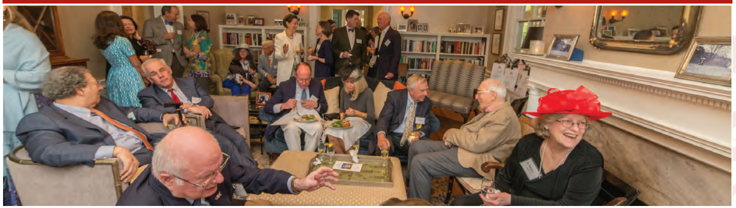
A perfect home for a gathering.