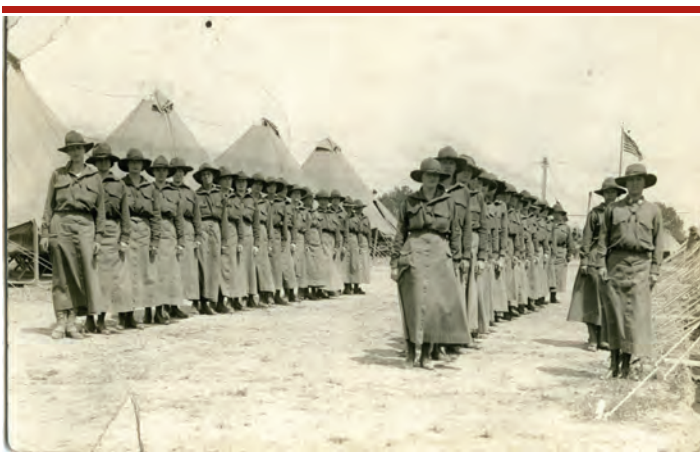
Connecticut Avenue School for Women