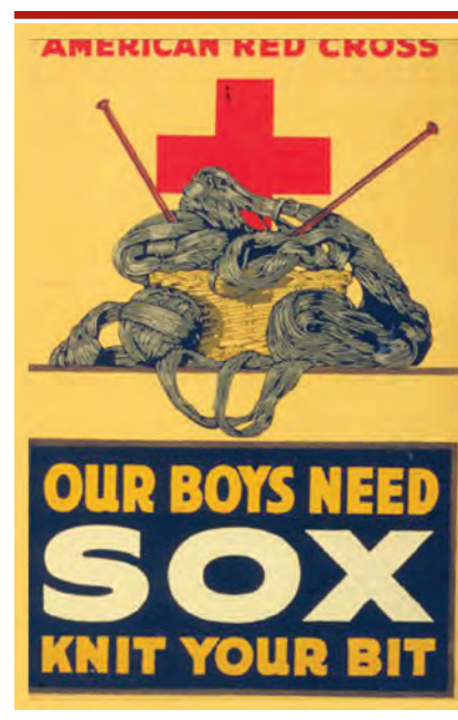
WWI poster designed to generate feelings of patriotism

2017 represents the Centennial Celebration of the U.S entry into World War I. Chevy Chase Historical Society is interested in developing a collection of WWI memorabilia and related materials. Please contact CCHS at info@chevychasehistory.org for more information.