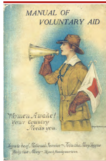
Manual of Voluntary Aid