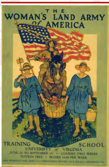
The Woman's Land Army of America

his medical experiments. He found the solution in a new two-bedroom rental house only a few block south of Chevy Chase Circle on 33rd Street in Chevy Chase, DC.