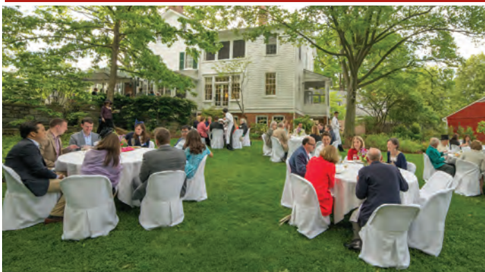
The sky cleared for dining on the lawn.