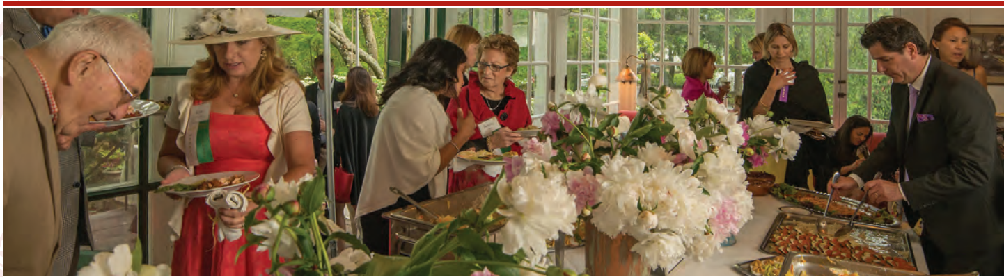
An inviting buffet table decorated with peonies.