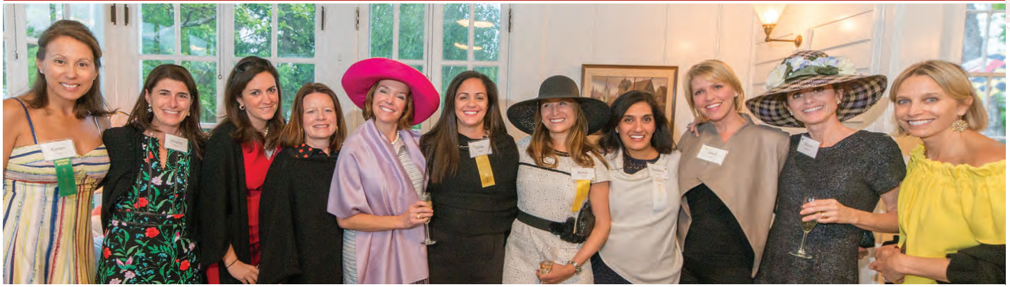
Warm friendships and festive hats on display.