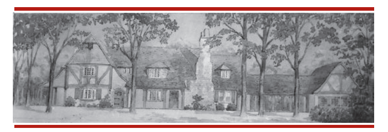
The restored rendering of a graceful Tudor home of distinction

The grim was as black as could be. The matting around the drawing was disintegrating. The back panel was warped and had heavy water stains. When I took it all apart I found insect infestation. I cleaned the grim, and replaced the front matting and the back panel. The picture is large – approximately 18 by 36 inches – but what is the fine Tudor residence that it depicts?