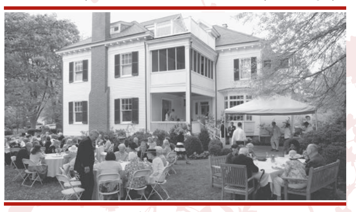
Dining al fresco on the west lawn