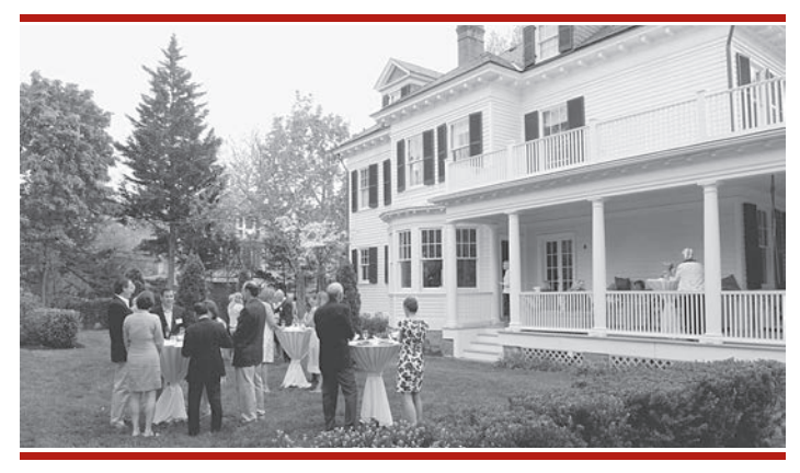
Champagne on the east lawn