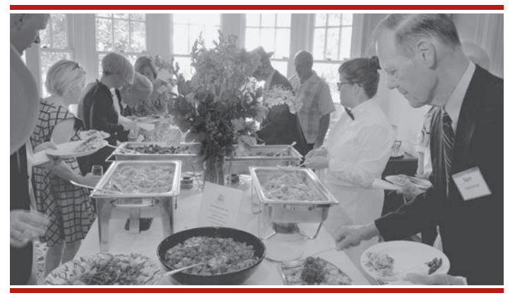
Guests partake of the deletable buffet