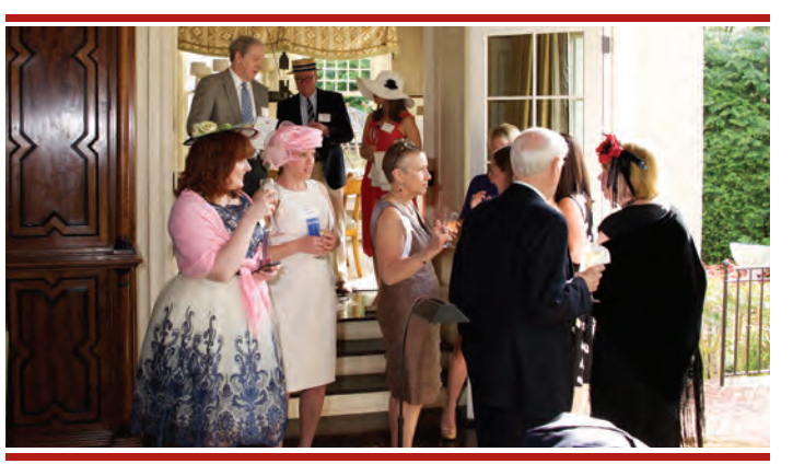
Guests mingle and enjoy the view of the gardens