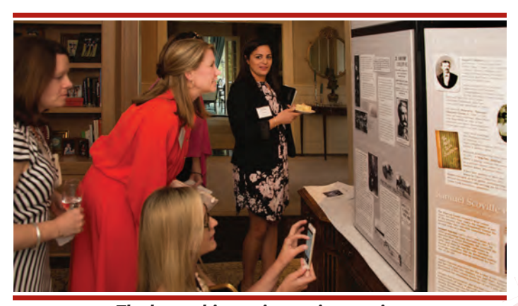
The house history is very interesting