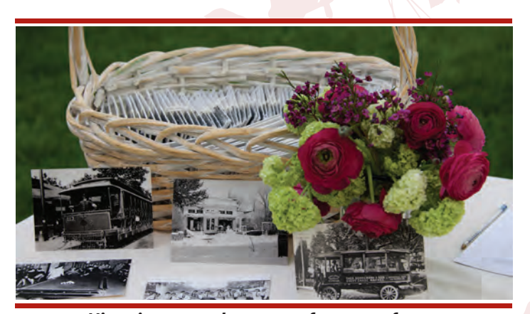
Historic postcards were perfect party favors