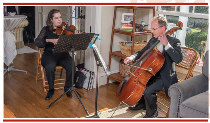
Members of the Perfect Harmony String Ensemble entertain guests