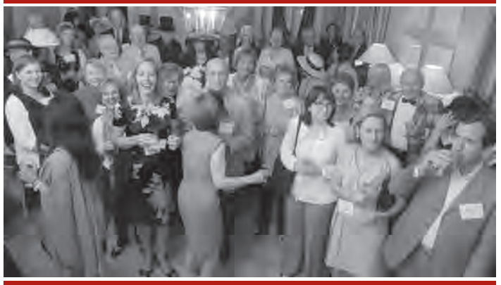
The assembled guests watch with delight