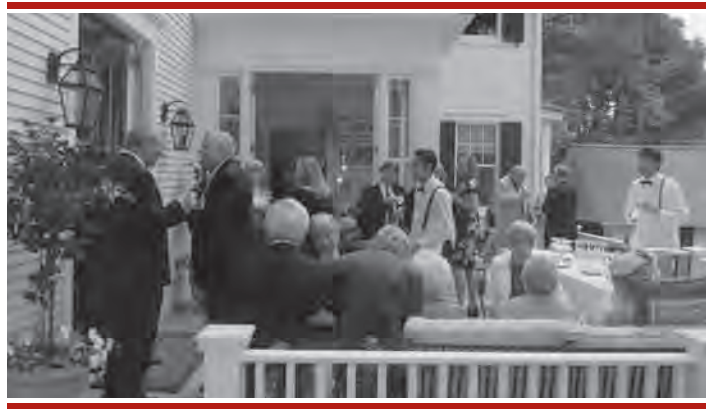
Champagne is served on the balcony