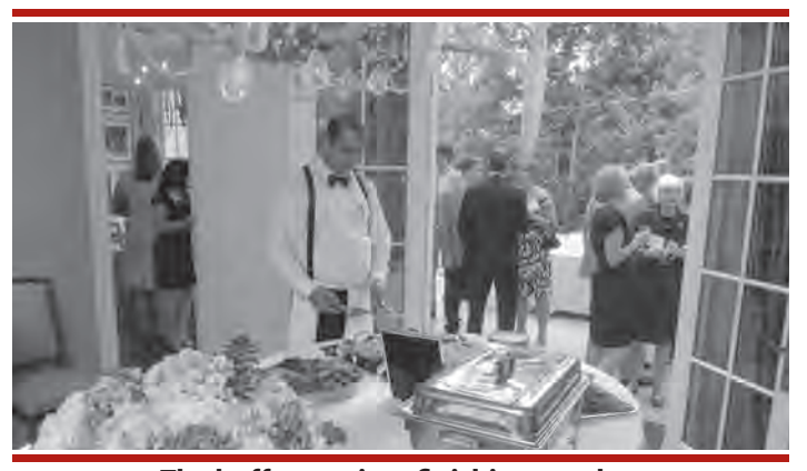
The buffet receives finishing touches