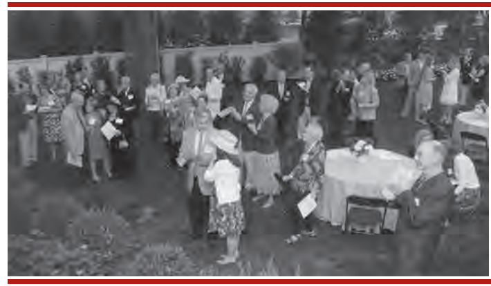
Diners on the lawn rise and join in song with the musicians and guests above